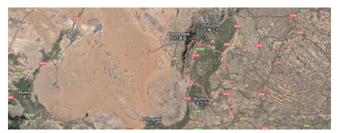
Figure 1.The location information of Yinchuan

An experimental study on the energy yield performance of TOPCon bifacial PV modules compared to PERC bifacial PV modules was conducted in Yinchuan (38 ^{\circ} 35 ' N, 106 ^{\circ} 1 ' E), Ningxia province, the northwest of China. The experimental results have proven that the energy yield gain of TOPCon bifacial modules is up to 3.82% higher than that of the PERC modules.